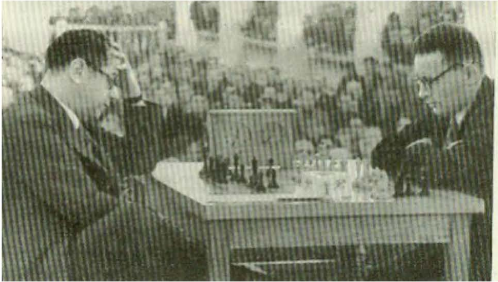
The AVRO game between Mikhail Botvinnik (right) and Capablanca (left)

What happened to our two heroes in and after the tournament?