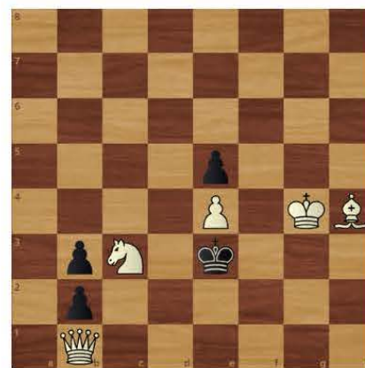
Level 2 puzzle - White to play and mate in 3!