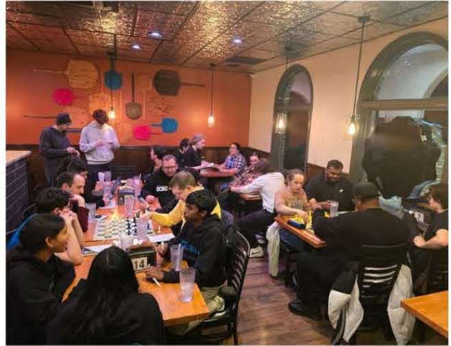
The "after party" with numerous groups celebrating a fine event.

In the end, it was tough to be too mad at the 2196 team, not only are they all great guys who most of the PA chess community have known for years, but they invited anyone interested to the "after party" where they went over games for tons of players and shared their thoughts on various positions and gave encouragement to many up and coming players.