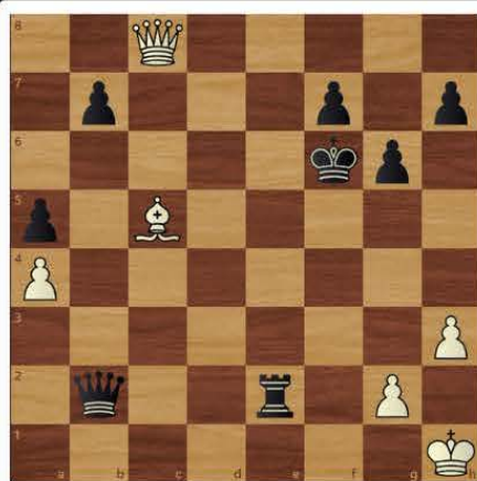
Level 1 puzzle - White to play and win

Still, for casual players or anyone just starting to study endgames, it is one of the best books available. Despite a few shortcomings, Silman's Complete Endgame Course stays an exceptionally well-written and highly approachable resource, one that every new chess player should begin with, even if they eventually outgrow it.